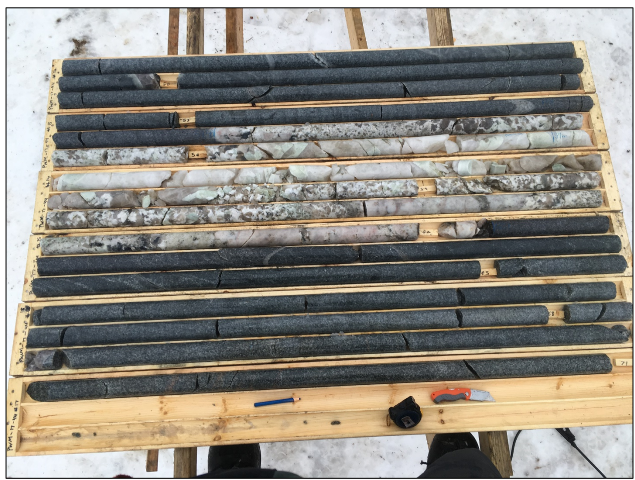
Figure 1 PWM-17-44, Boxes 12 to 17, photo of new spodumene pegmatite dyke below the Main Dyke. Note abundant pale green spodumene in quartz core in boxes 13 and 14.

The Company is excited to announce a 2000 m drill program on the Northeastern Dyke commencing the first week of January 2018. This drill program is fully funded and will drill the newly found structure located 900 m northeast and along strike of the recently completed drill program (See news release dated Nov. 13<sup>th</sup>, 2017). Power Metals discovered up to 40% spodumene on surface open in all directions at this new location.