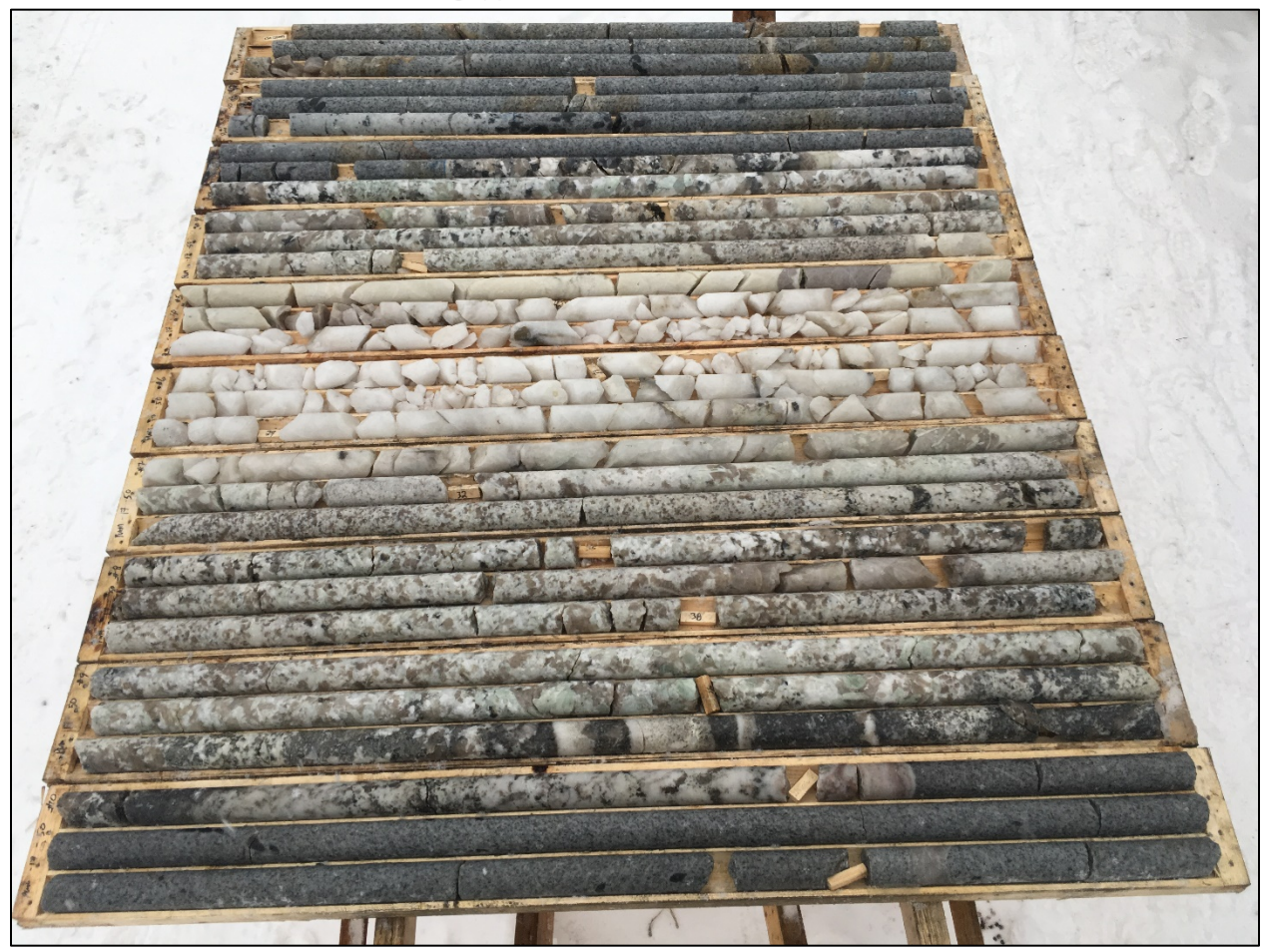
Figure 2 PWM-17-50 Main Dyke continuous pegmatite from 11.18 to 43.2 m. Note abundance of spodumene in boxes 3 and 4 and 7 to 9. Quartz core is in boxes 5 and 6.