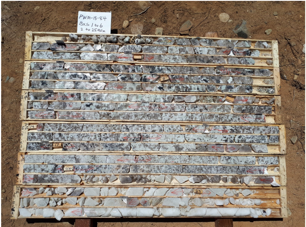
Figure 1 PWM-18-84, boxes 1 to 6, spodumene pegmatite with up to 10% spodumene (boxes 1 to 5) and quartz core (box 6), Main Dyke, Case Lake.