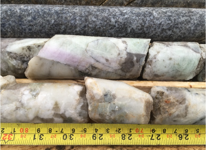
Figure 4 coarse-grained spodumene at 12 m, PWM-18-111, West Joe Dyke. Note spodumene crystal with pink rim and green core.