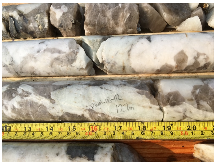
Figure 5 14 cm long spodumene crystal at 12.7 m, PWM-18-112, West Joe Dyke.