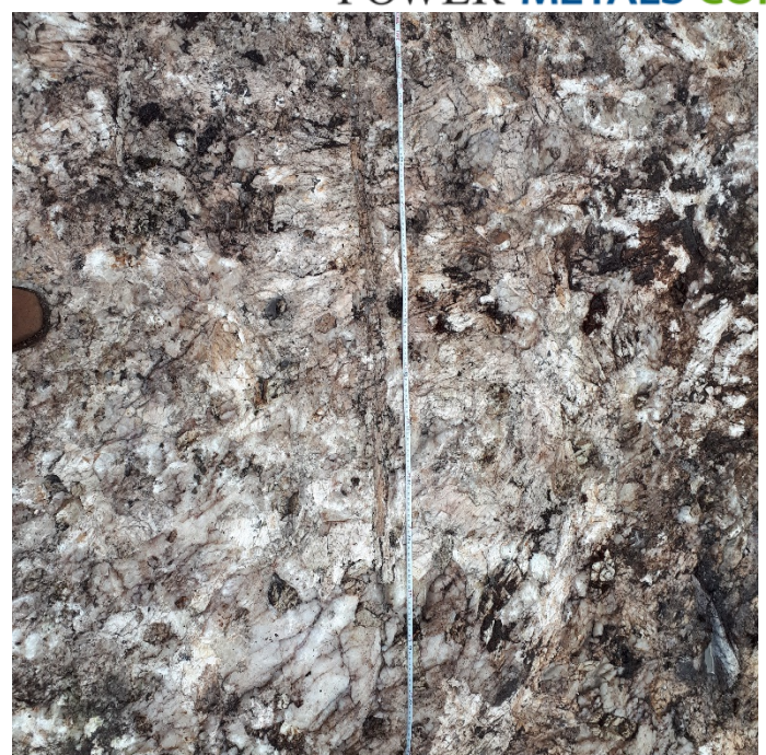
Figure 2 1 m long spodumene blade in West Joe Dyke, Case Lake Property.