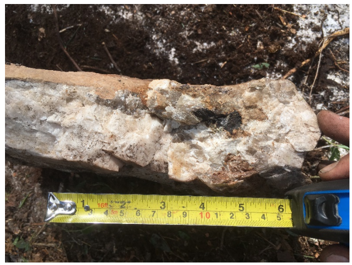
Figure 3 3 cm long Ta-oxide crystal, West Joe Dyke, Case Lake Property.

Figure 2 1 m long spodumene blade in West Joe Dyke, Case Lake Property.