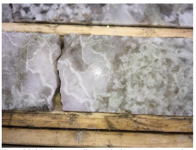
Figure 3 Pale pink to grey pollucite with white veining next to pale green spodumene at 49.5 m, PWM-18-116, West Joe Dyke.