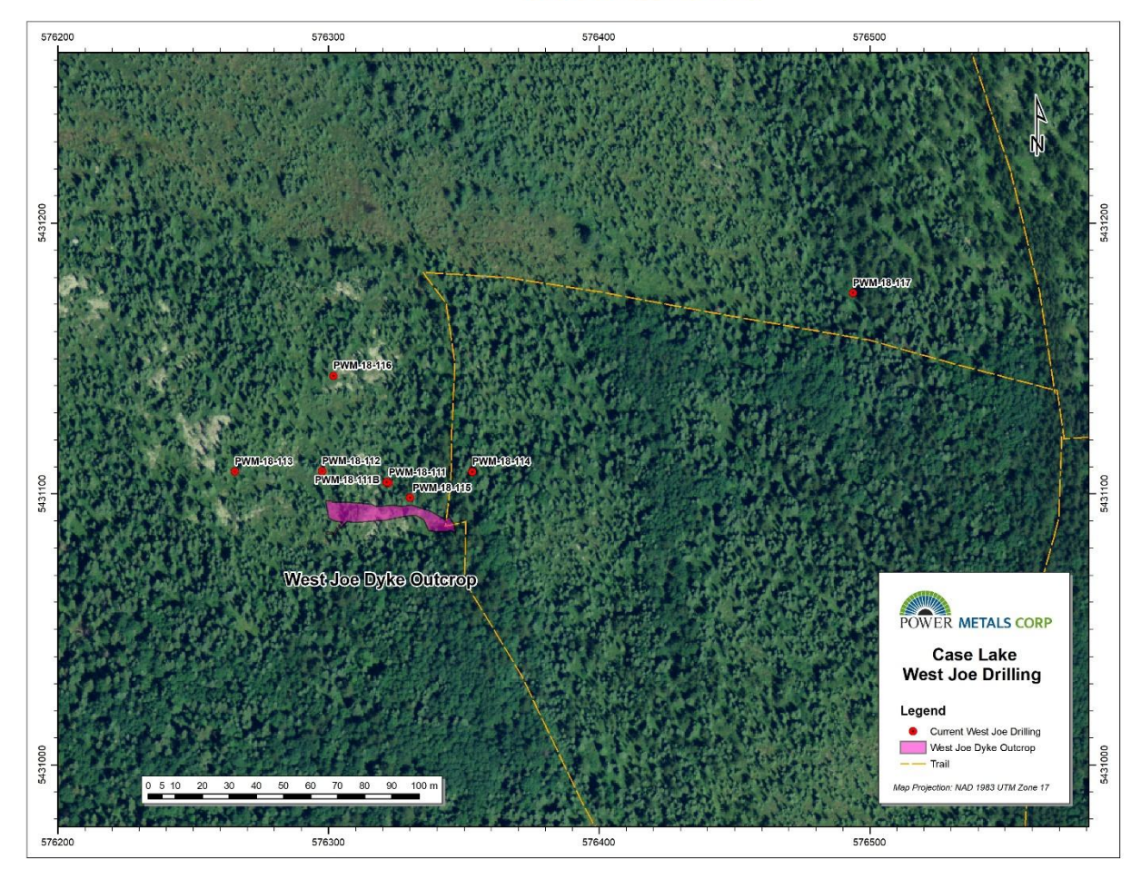
Figure 5 Location of drill hole collars for West Joe Dyke drill program.