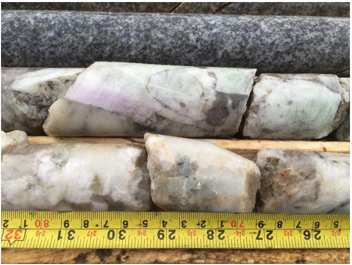
Figure 1 Coarse-grained spodumene at 12 m, PWM-18-111, West Joe Dyke. Note spodumene crystal with pink rim and green core.