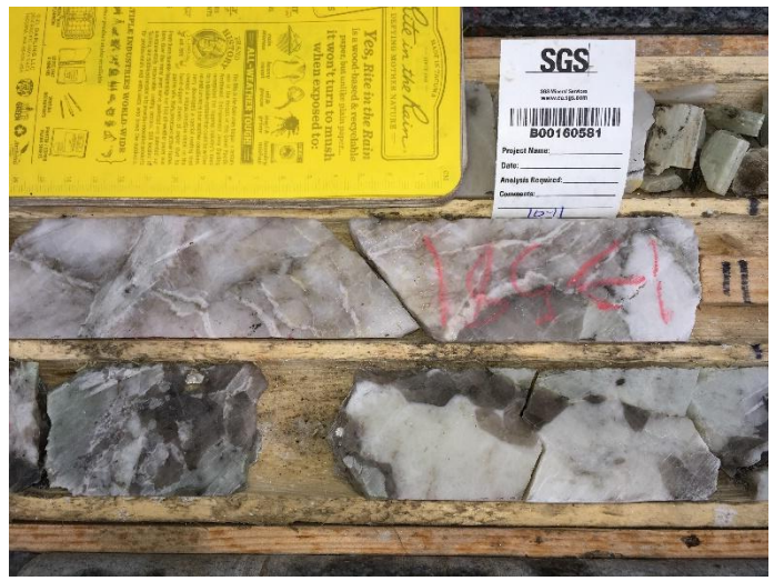
Figure 2 Pollucite with white veining in drill core at 11 m, PWM-18-112, West Joe Dyke.