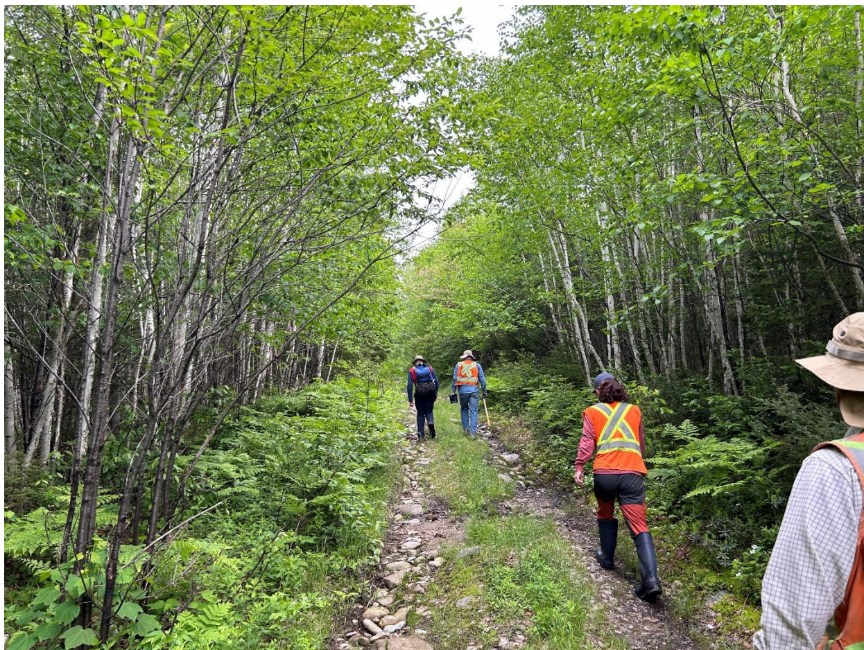
Figure 2 – Field Team on Access Track at Mazerac in Quebec

Power Metals has mobilized a team of geologists at its 100% owned Decelles and Mazerac properties in northwestern Quebec and completed our maiden field exploration activities on the properties. Historical and recent exploration work completed across the region, including within Power Metals' claims, has defined LCT pegmatite prospective geology in Decelles and Mazerac (Figure 2).