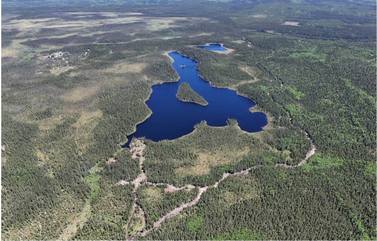
Figure 6 – Drone Image of the Archaeological Study Area at Case Lake