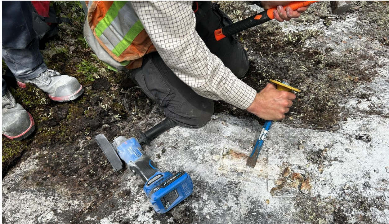
Figure 3 – Sampling of a Pegmatite at Mazerac in Quebec