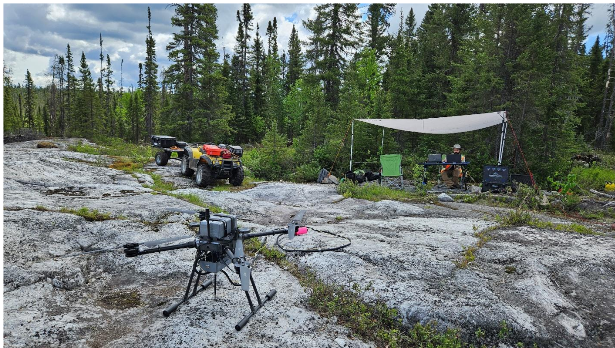
Figure 5 – Drone Survey being conducted at Case Lake

Pioneer Exploration Consultants of Ottawa completed the previously announced high-resolution drone-based magnetic survey at Case Lake. A total of 944 km was completed with the low-level, high-resolution magnetic data that was collected at 25-meter line spacing. The survey covered high-priority target areas that occur on the main Case Lake mineralization corridor that extends from Dome Nine in the east to West Joe in the West (Figure 5).