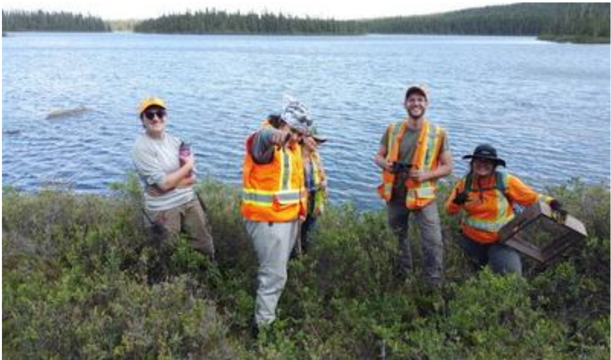
Figure 7 – Archaeological Team at Case Lake