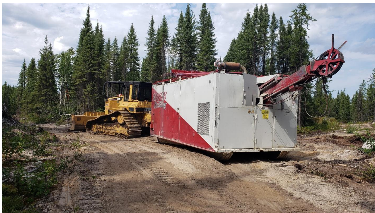
Figure 1 –Major Drilling Mobilizes Drill Rig to Case Lake

Haydn Daxter, Power Metals' CEO commented "The Company is extremely excited to have a drill rig back on the ground at Case Lake as we continue to test and develop our cesium footprint at West Joe and Main Zone. Drilling is expected to continue over the next 6-7 weeks for all exploration holes planned for Phase II, with the first round of assays expected in October".