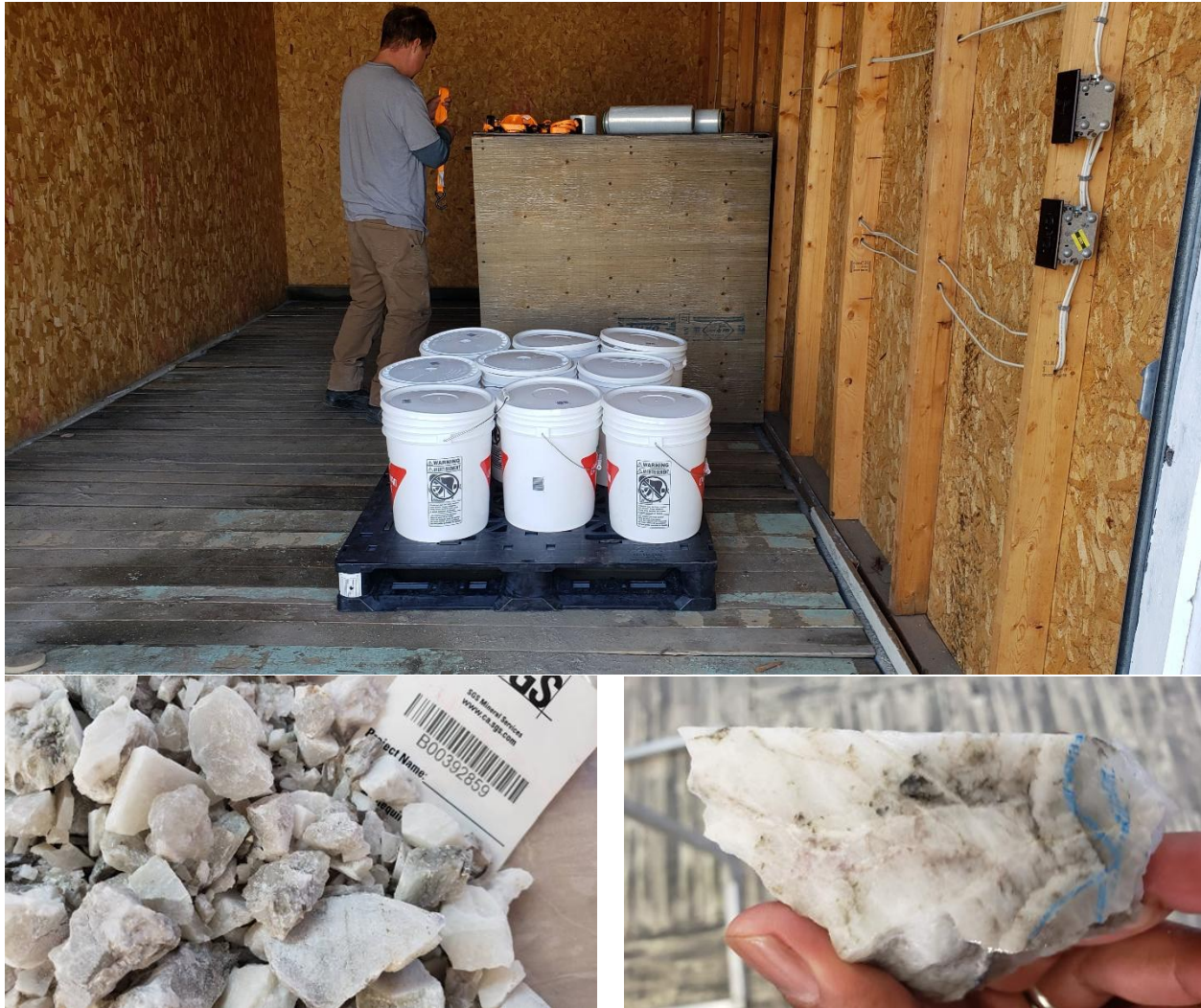
Figure 3 – Met Test Work Samples for SGS Canada and Tomra Australia