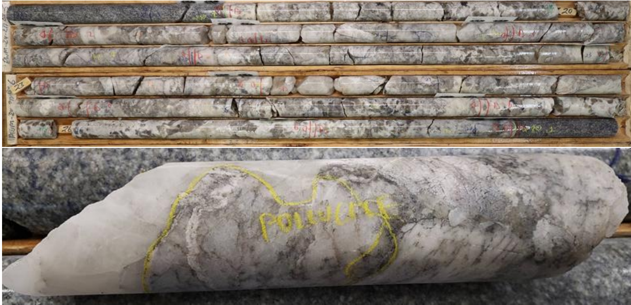
Figure 2 – Photo of drill core from PWM-24-211 displaying 8 meters of Pollucite from West Joe at the Company's Case Lake Property, Ontario, Canada