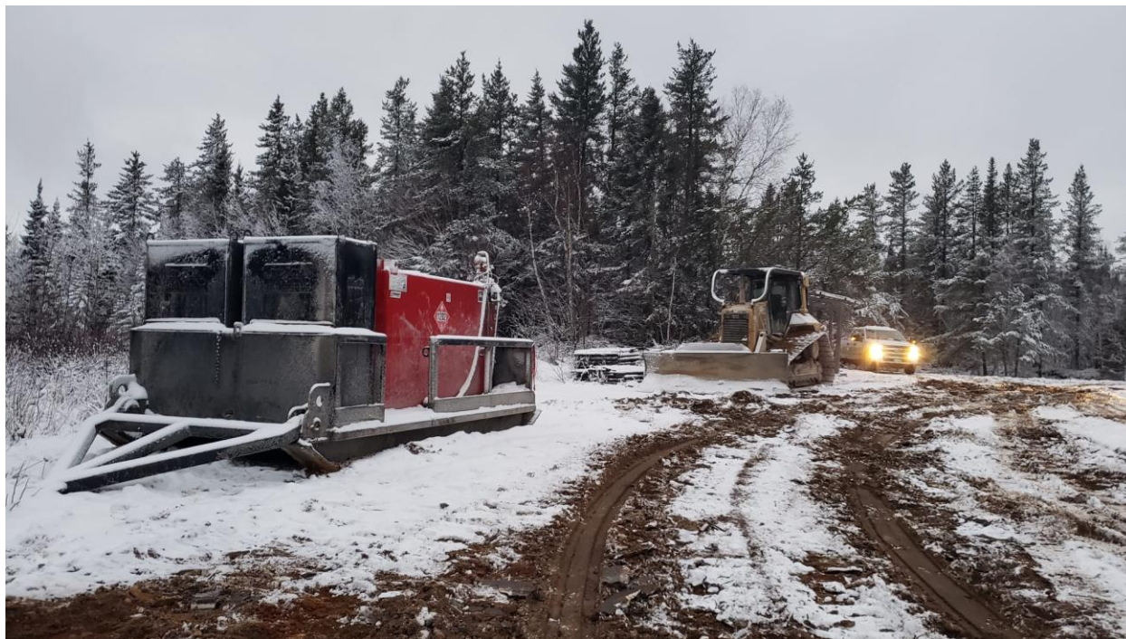
Figure 1 – Image of Black Diamond drill equipment on the ground at Case Lake, Ontario, Canada

The Company previously intercepted high-grade cesium and tantalum in Phase I (reported June 18, 2024) and will continue releasing results from Phase II over the next four weeks. Several overlimit samples have been submitted to SGS Labs for further analysis, with final results expected this month – reinforcing Power Metals confidence in the resource potential at Case Lake.